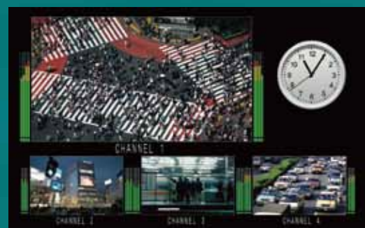
Customized layout (Example)