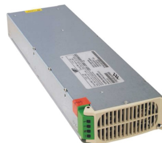
slide-in power supply for easy maintenance