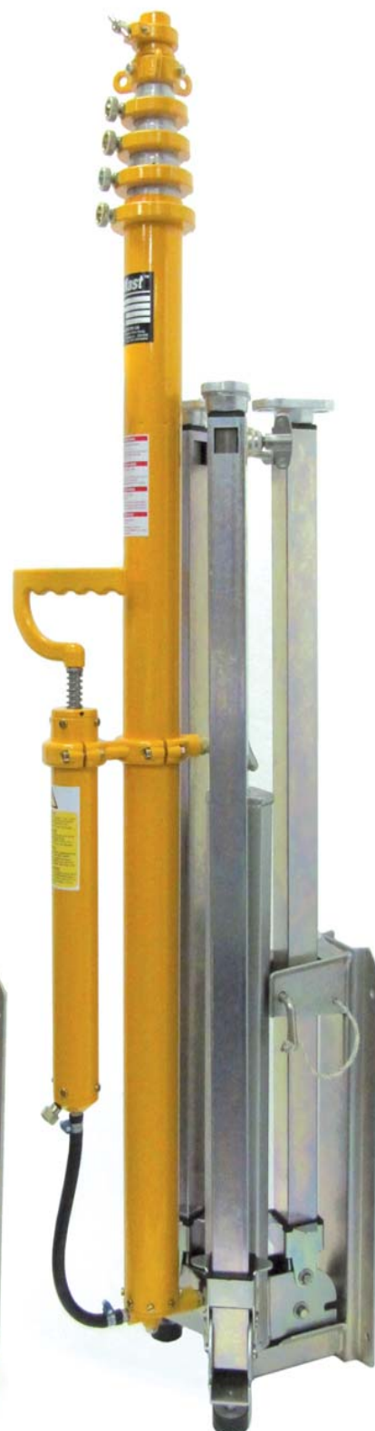
1 Mk VI Tripod Stand Model